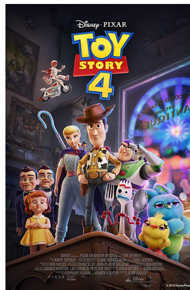
August 8th - Toy Story 4