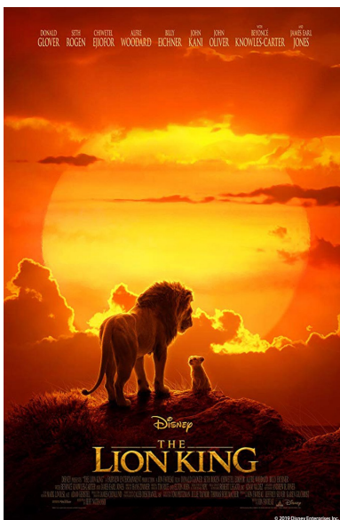
July 11th - The Lion King

Plan to bring your family and friends, its a great way to enjoy a free night out in DeWitt!