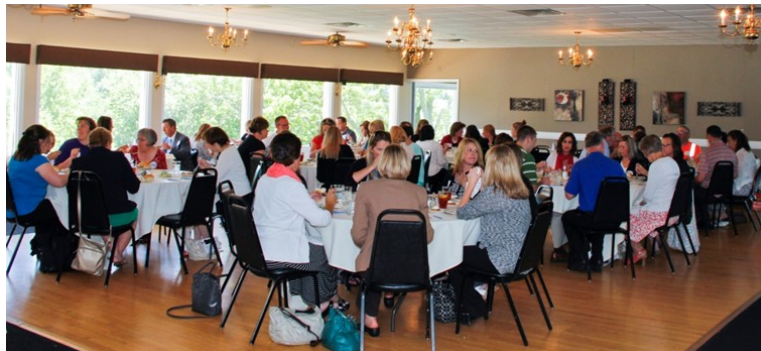
(2015 eat Lunch & Learn something session)

Admission: $20 for DCDC Members. Discounts will be applied for specific DCDC Membership Tiers. You will be notified after registration if you receive a discount. Not Yet Members are $25. RSVP HERE