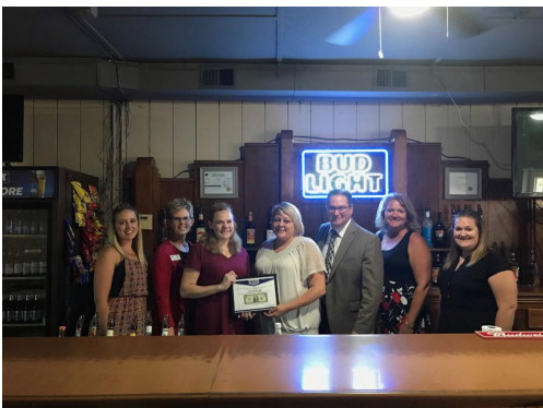
The DeWitt Ambassadors recently