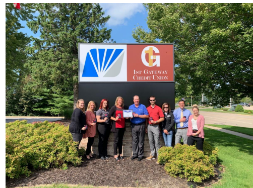
The DeWitt Ambassadors presented a